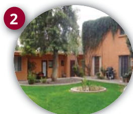
Scottsdale Townhouse Apartments