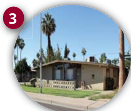
3208 N. 68th Street