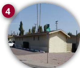
3231 N. 66th Place