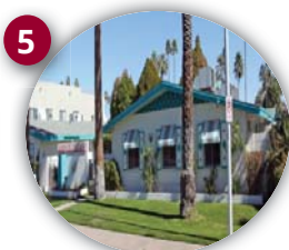
3621 N. 68th Street