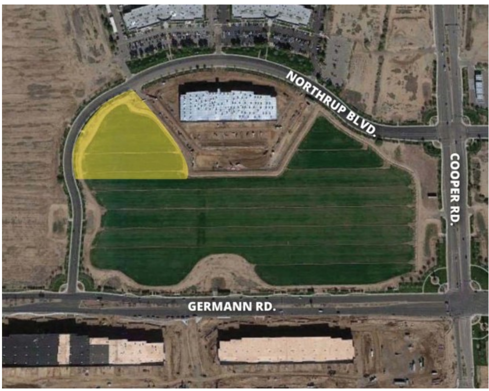
An aerial view of the sold land

Az Business | AZRE | People & Projects to Know | Ranking Arizona | Az Business Leaders | Scottsdale Living | Experience AZ | Play Ball | Creative Designer