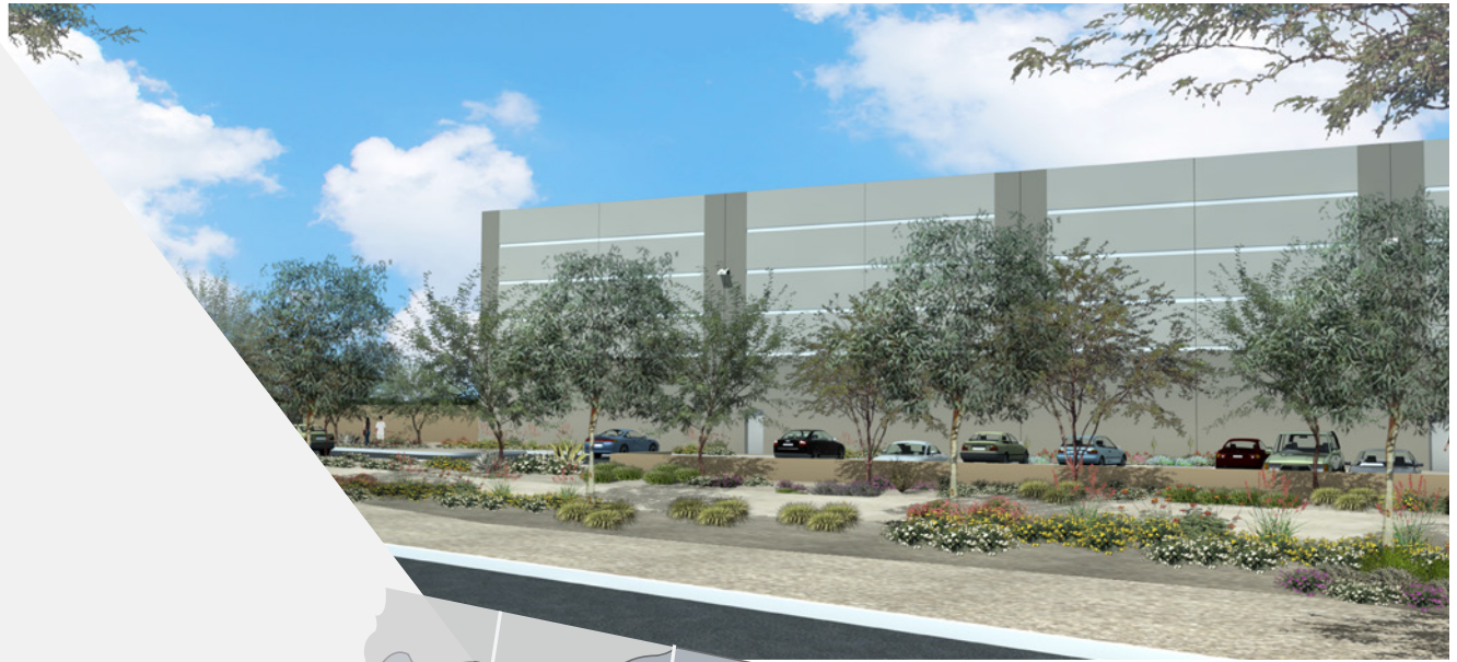
PERSPECTIVE FROM 32ND STREET AND SOUTH AVENUE