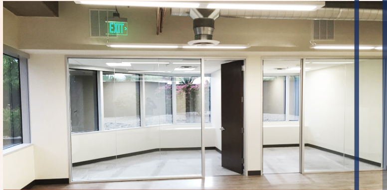
CONCRETE FLOORS AND ALL GLASS FRONT OFFICES