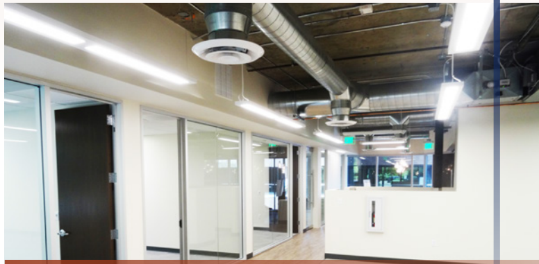
14' OF CLEAR HEIGHT WITH EXPOSED CEILINGS

3200 E. Camelback Road, Suite 100 Phoenix, Arizona 85018 602-956-7777 http://www.leeearizona.com