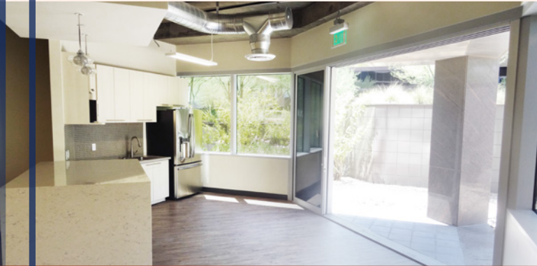
PRIVATE PATIO WITH SLIDING NANO DOORS