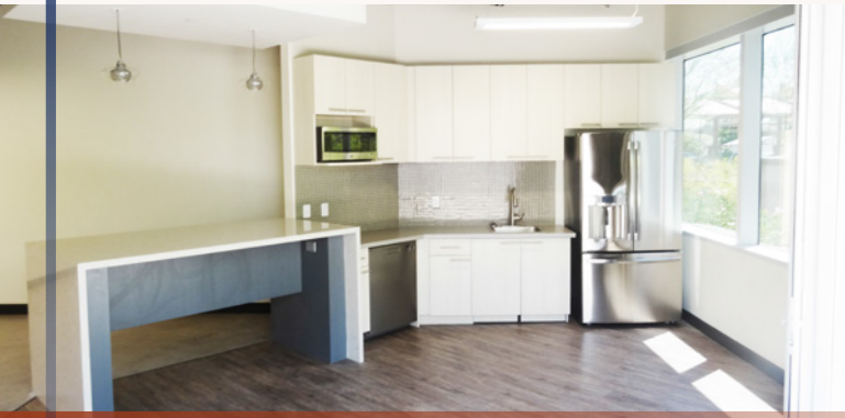
OPEN BREAK ROOM WITH STAINLESS STEEL APPLIANCES