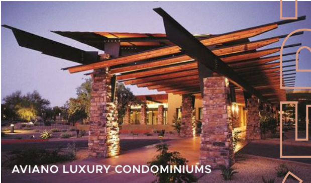
AVIANO LUXURY CONDOMINIUMS