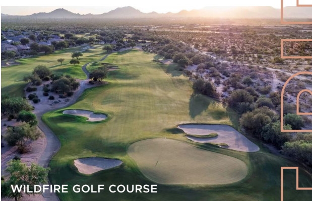
WILDFIRE GOLF COURSE