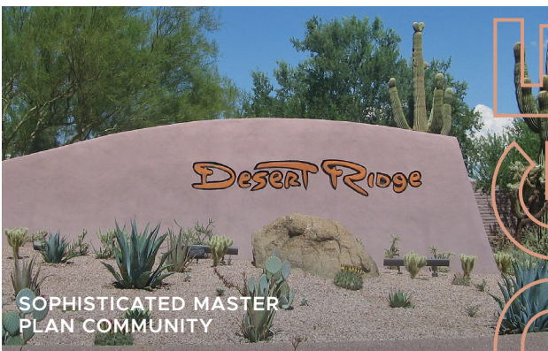
SOPHISTICATED MASTER PLAN COMMUNITY