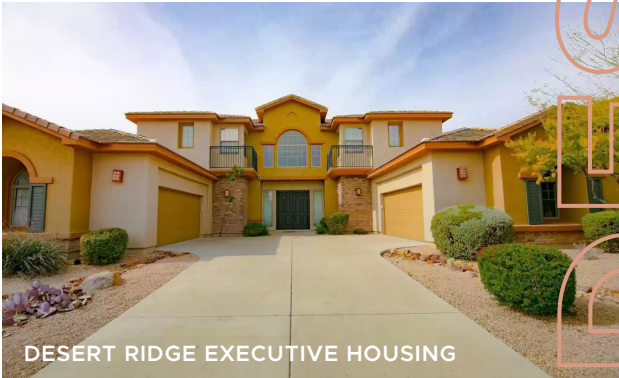
DESERT RIDGE EXECUTIVE HOUSING